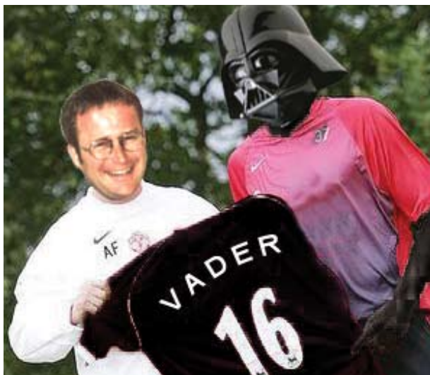
The Dark Destroyers:

The Dark Destroyers Leader Chieftan is quite satisfied with his performance in the opening fixture (a 1-1 draw with FC Wazzup). Speaking yesterday The Chief said "The Back Garden is a nice compact little ground tucked away in a lovely peaceful hamlet called Bodmin. I may go back there for a holiday in the summer. The neighbours, however were getting a little irate by the fact that the match-ball (and sometimes an opponent) would come spinning