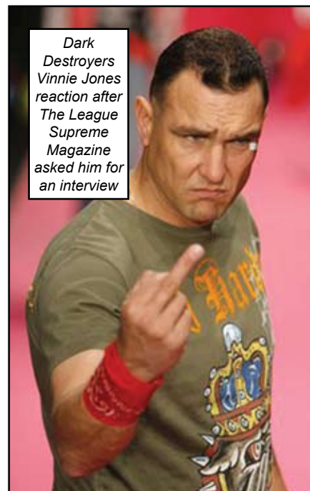
Dark Destroyers Vinnie Jones reaction after The League Supreme Magazine asked him for an interview